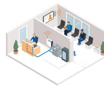
Active network components