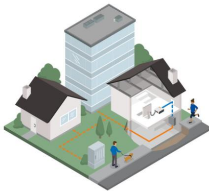
Fiber optic cabling

Discover a broad and at the same time deep product portfolio with over 10,000 products and everything you need to build an entire network. With us you will not only find proven products for standard applications, but also special products for special purposes.