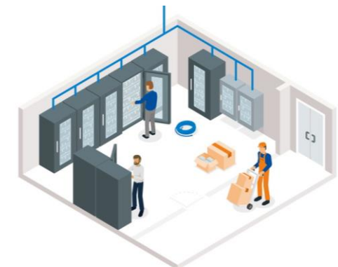
Network and server cabinets